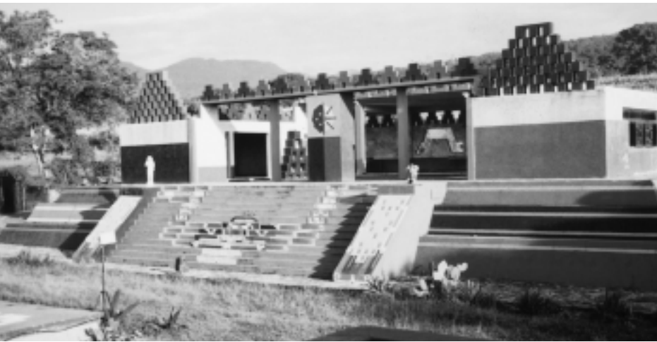
Nahuatl University buildings are pyramids decorated with traditional symbols.

the vision that emerges is one of wholeness: as an act of healing the fragmented identity, individual and collective, the temazcal reunites its participants with their natural, cultural and spiritual heritage.