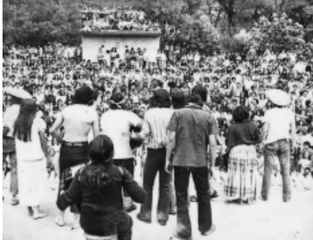
An audience of 2,000 attends Mascarones Theatre's performance of "Don Cacamafer" at the Casa del Lago theater in Mexico City's Chapultepec Park during the 5th Annual TENAZ Festival in 1974.

20 Tajin (thunder): An important ceremonial center in the state of Veracruz.